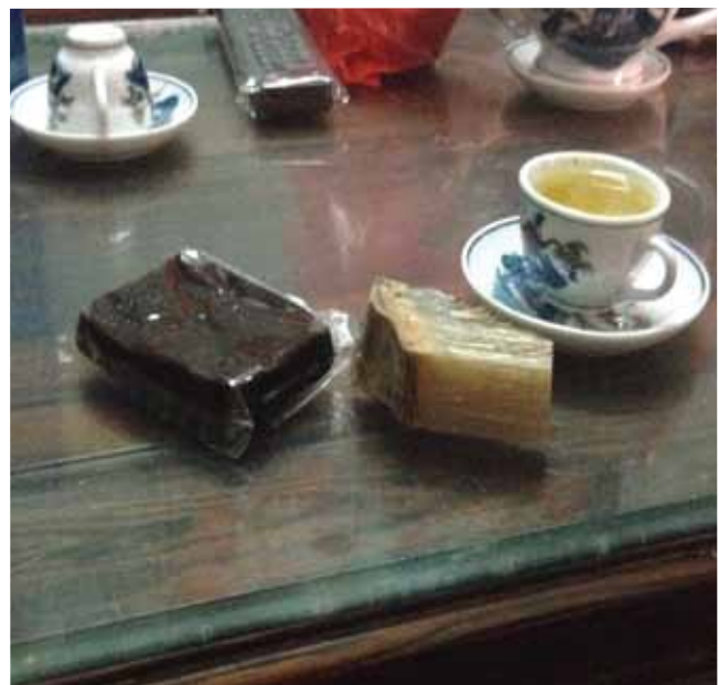
A piece of rhino horn and block of tiger bone TCM at a private home in Hanoi during a March investigation with Environmental Police

The ENV Wildlife Crime Unit is credited with helping bring transparency to wildlife protection efforts at the provincial level, and has provided critical information to law enforcement agencies and decision-makers on trends in the wildlife trade. It has also profiled major transnational smuggling operations involving tigers, rhino horn, and other endangered species of global importance.