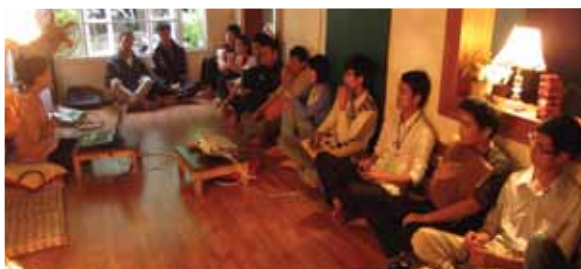
Volunteers in Nghe An province participate in a club meeting in preparation for monitoring of business establishments in the city of Vinh