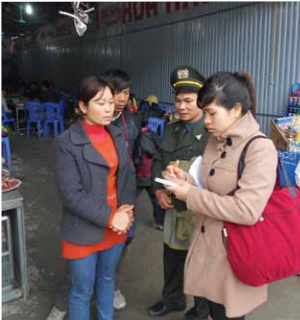
ENV monitoring staff and a forest ranger from My Duc district confront a restaurant owner over a violation during joint inspections of restaurants operating outside of Huong Pagoda

claimed otherwise, telling undercover ENV teams that the animals they hung in front of their shops were, in fact, from the wild.