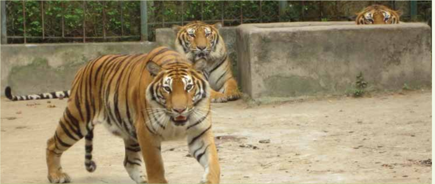
Tigers at one of Vietnam's nine private farms and zoos. Growth of tiger farming in Vietnam has been largely arrested, but farmers continue to push to open the legal trade. ENV conducts regular monitoring of farms to verify compliance with regulations and report violations