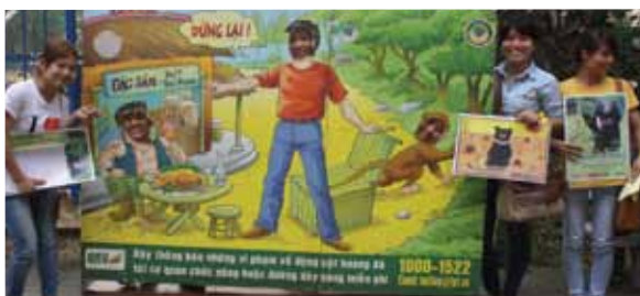
Villain, hero, or lucky animal? A popular part of ENV wildlife trade campaign events is to pose for a photo with your friends as these students are doing at an event in Hanoi.