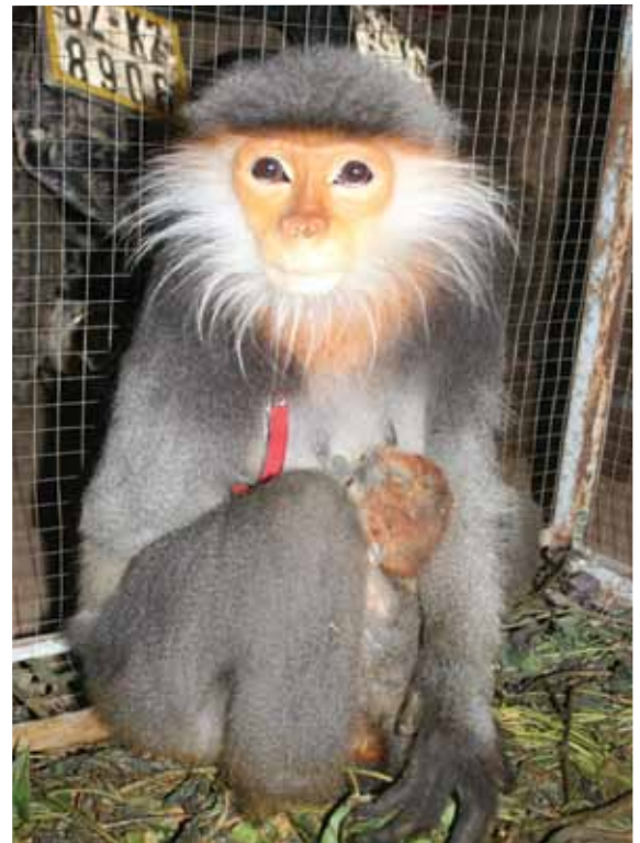
A mother gray-shanked douc langur and baby were transferred to a rescue center at Cat Tien National park after ENV received a call from a resident in Kon Tum province wishing to voluntarily turn in the critically endangered langur, endemic to the central region of Vietnam