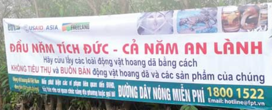
One of the few surviving banners urging the public not to buy or consume wildlife along the river traveled by visitors to the Huong Pagoda. Nearly all of the other banners put up by ENV were torn down, probably by restaurant owners

Next year, ENV will approach the campaign more aggressively during the months leading up to Tet, when restaurant owners reportedly conclude their agreements with local authorities for rental and use of land near the site.