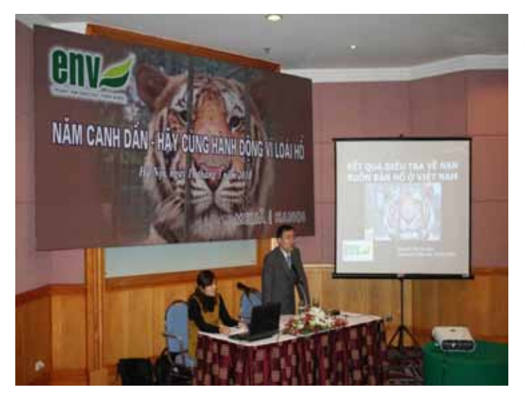
ENV released a public summary report on the findings of a 12-month investigation during a press conference in March. In May, a classified and more detailed version of the report was released to law enforcement agencies and some key government representatives

ENV plans to continue its investigation in cooperation with key agencies through 2010, while working to encourage law enforcement agencies to focus their efforts on investigating and prosecuting key figures in the illegal trade, as well as cooperating with neighboring countries to close down international links responsible for supplying most of the tigers coming into Vietnam.