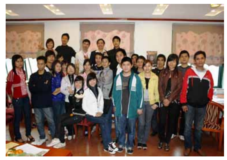
A recruitment meeting in Quang Ninh bolstered the ranks of ENV's volunteers there. Volunteers help with monitoring of business establishments to ensure compliance with wildlife protection laws

ENV has produced five public service announcements over the past few years aimed at encouraging the public not to buy or consumer bear bile. ENV's PSA's air on national television and are also distributed to provincial TV stations and aired locally.