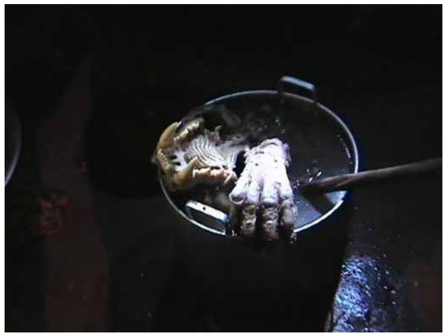
Although smuggling and trade of tigers may be widespread, only a small number of people are suspected of controlling much of the trade into Vietnam

ENV's Wildlife Crime Unit and our field investigations are intended to assist our partners in law enforcement and encourage interest and focus in the pursuit of key figures and their criminal enterprises that are behind the illegal trade of wildlife.