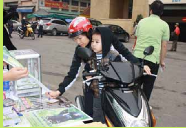
Drive-up pledges accepted! A woman pulls up on her motorbike to sign a pledge not to use bear bile. Since 2008, ENV has collected more than 55,000 signed pledges from residents throughout the country.