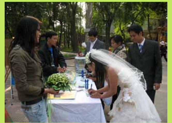
The bride and groom take a moment from their "special day" to sign pledges not to consume bear bile